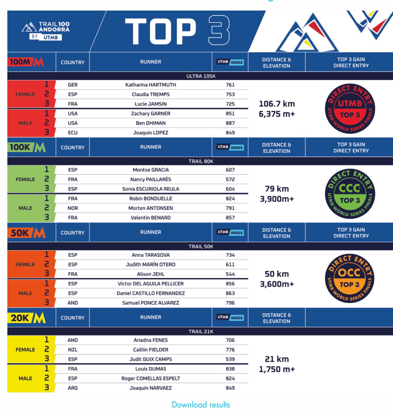
All results from the weekend are available on the following link.

Instagram: https://www.instagram.com/trail100andorra/ Facebook: https://www.facebook.com/Trail100Andorra